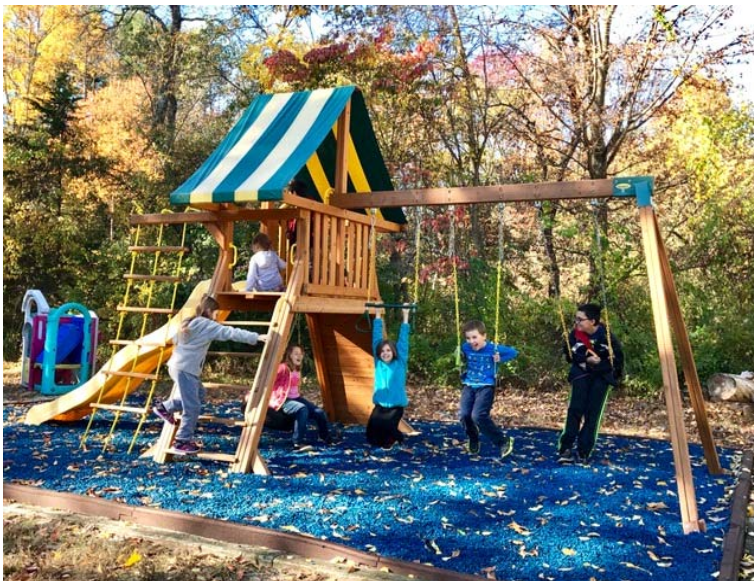
Sunday school class enjoying the new playscape for the first time on October 23rd!